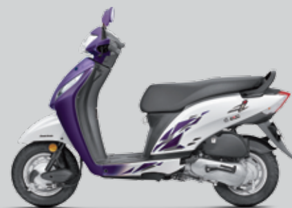
Orchid Purple Metallic