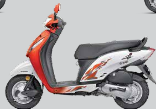
Neo Orange Metallic