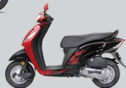
Imperial Red Metallic

1. Activa i meets Bharat Stage IV norms. 2. +The technical specifications and design of the scooter shown here may vary according to the requirements and conditions and are subject to change without any notice. 3. *Accessories shown in the picture are not a part of the standard equipment. 4. **Conditions apply.