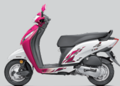
Lush Magenta Metallic